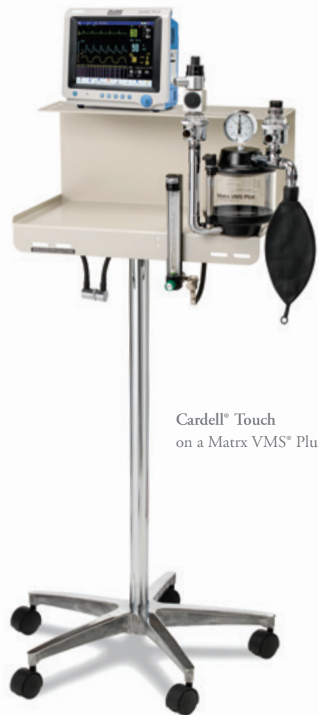
Cardell® Touch on a Matrix VMS® Plus

Smaller, lighter form factor designed for easier transportation without sacrificing visibility