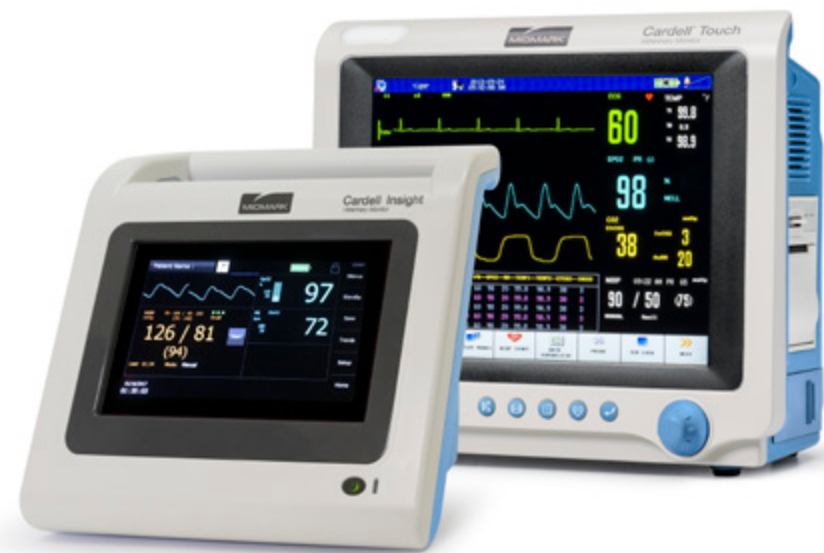
The Cardell® Family of Monitors

Monitoring solutions that deliver unmatched performance in exam, treatment and surgery.